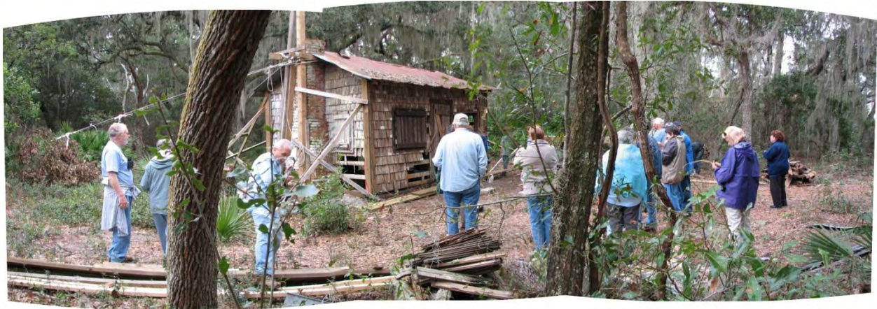
Tour group visiting cabin during restoration work. (2010-01-30, IMG Trout Lake Tour Pan)