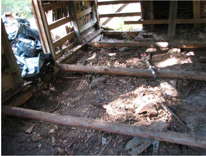
Rodent debris under cabin floor being removed. (2009-11-23, IMG 3985)