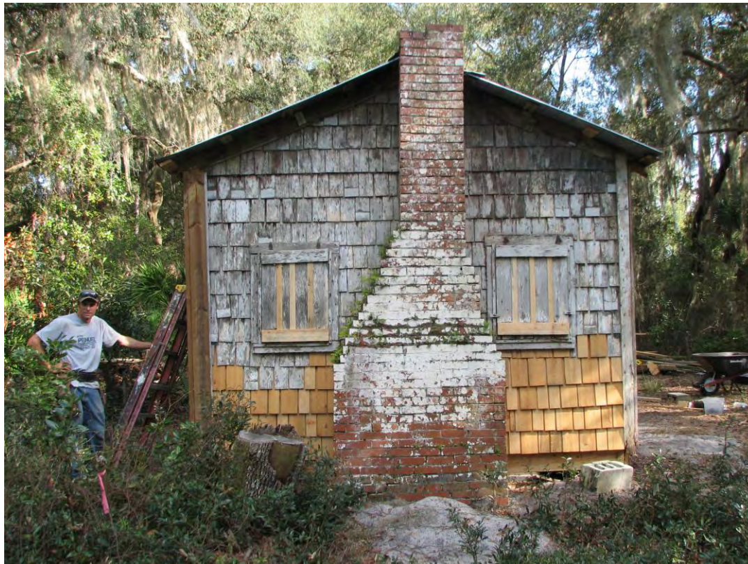
(2011_03_08, IMG4924) North wall, completed.