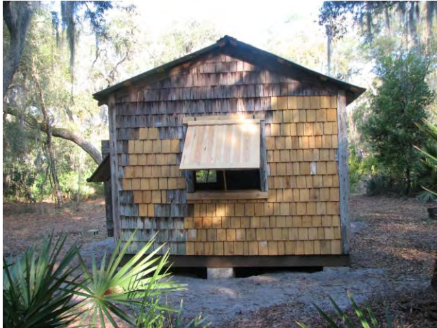
(2011_03_21, IMG 5105) South side of cabin.