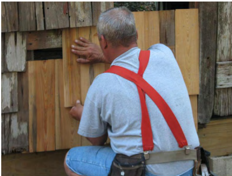
(2011_02_22, IMG 4841)