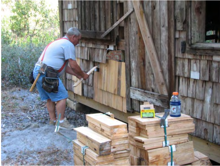
(2011_02_22, IMG 4845) Above and below: Inspecting, selecting, shaping and placing cypress shingle siding.