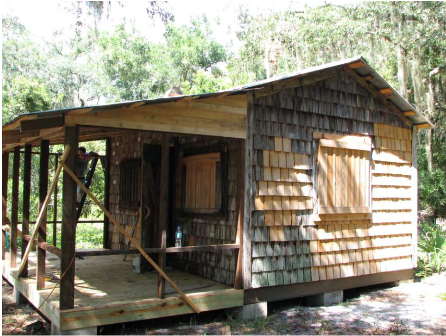
Porch ready for screening, (2011-09-23, IMG 5480)