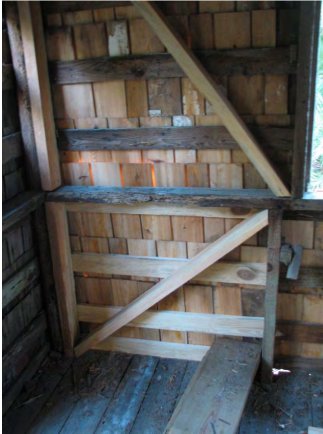
(2011_02_22, IMG 4835) Bracing detail showing diagonals, vertical “sisters” and replacement horizontal wall purlins(battens) to which cypress shingles are nailed.

Next came the painstaking inspection of every existing, original milled cypress siding shingle. Again, all that were structurally sound were left in place. Jeff had a mill in Williston, Florida custom mill matching cypress shingles to replace the rotten shingles and to fill the voids where they were completely missing. All work was by hand. Shingles were cut and shaped when necessary with a vintage roofer’s hatchet and then hand nailed in place.