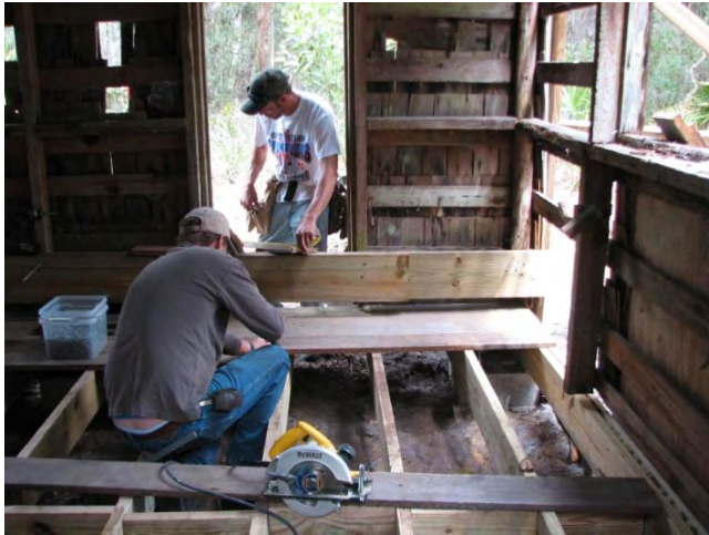
Re-installing “sound” original floorboards. (2010-03-17, IMG 4411)