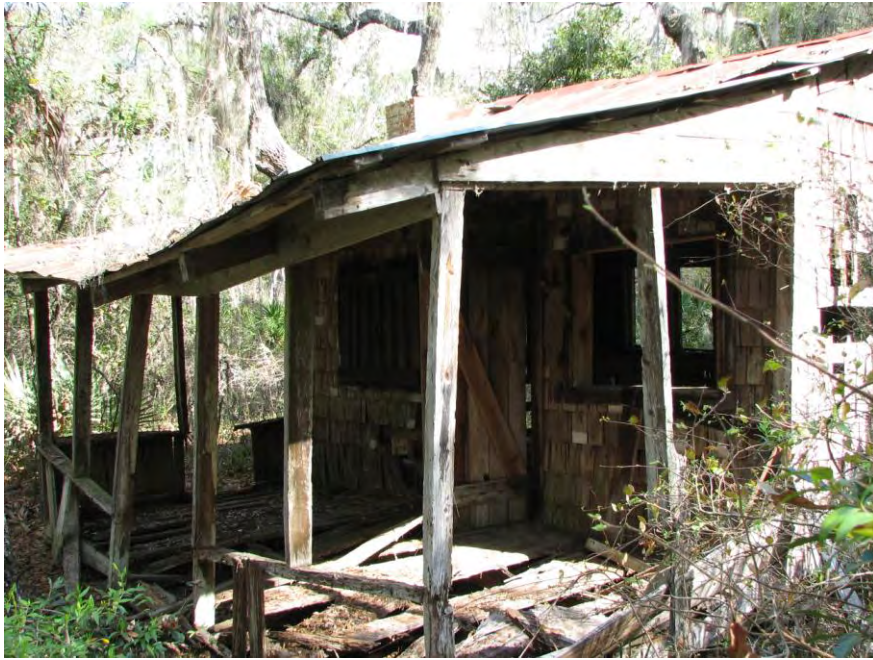
Close-up of deterioration in 2007. (2007-03-15, IMG 0352)