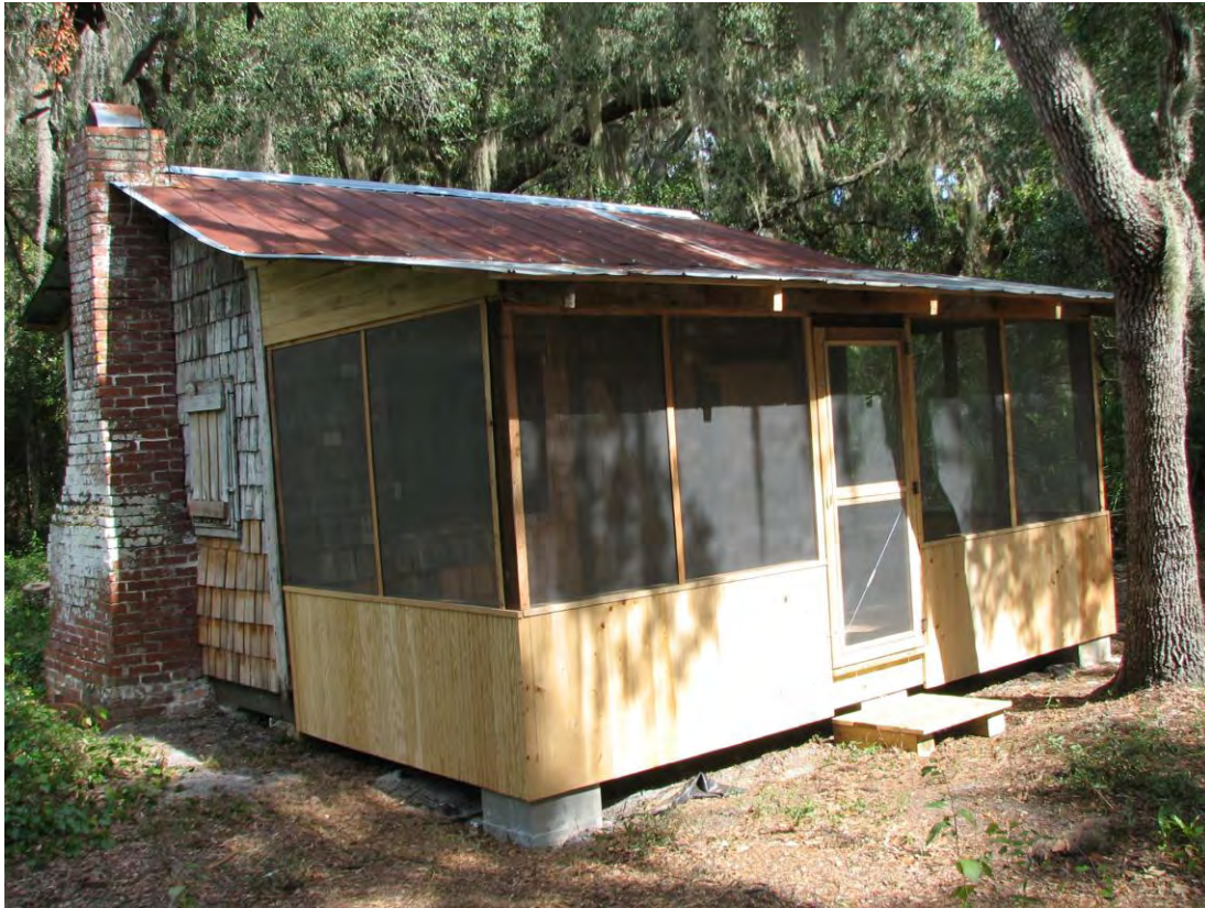
The final product. (2011-10-06, IMG 5547)