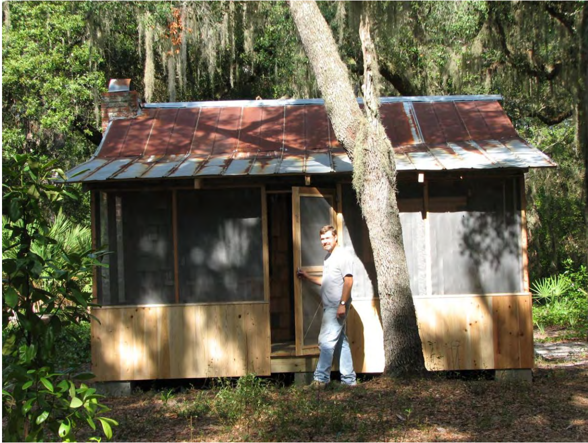
Welcome to the Carr family cabin. (2011-09-30, IMG 5522)