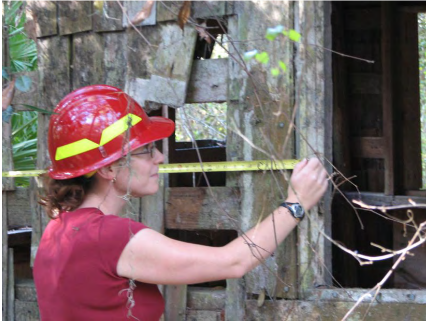
Documenting the cabin. (2007-03-23, IMG 0721)