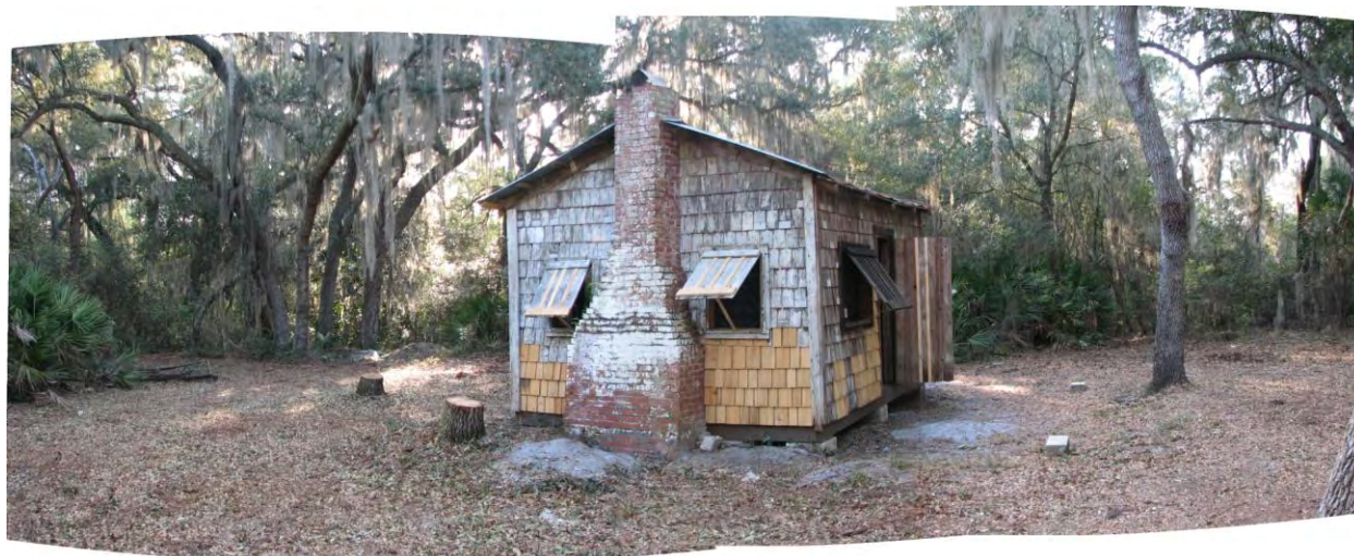
(2011_03_21, IMG Pan 1) Wide angle view from the NW, showing the north and west sides of cabin.