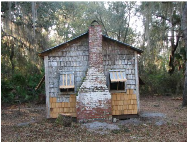
(2011_03_21, IMG 5104) North side of cabin.