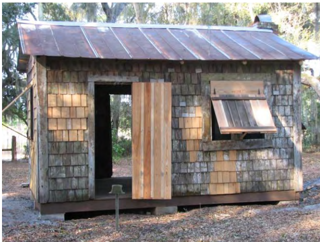
(2011_03_21, IMG 5099) East (back) side of cabin.