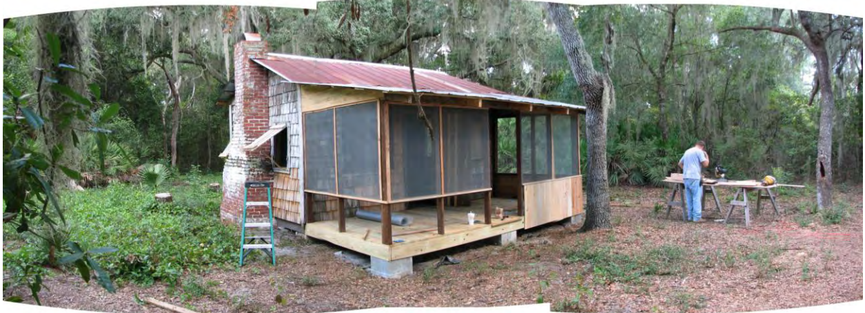
Nearing completion. (2011-09-29, IMG Pan 1)