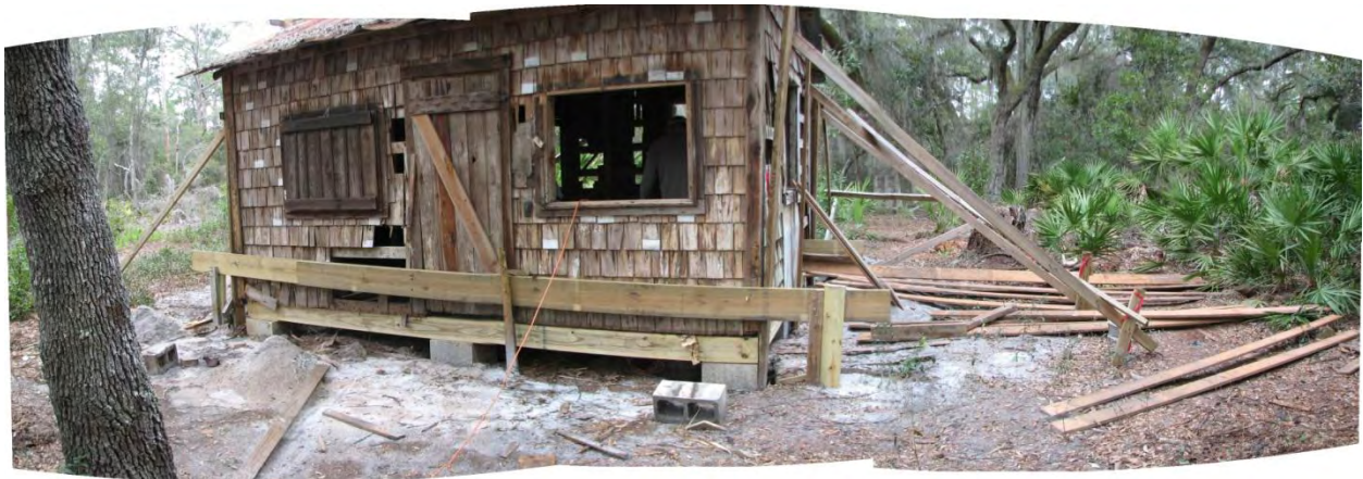
New foundation, sub-floor and original floor boards (on right) ready to re-install. (2010-03-17, IMG Carr Cabin Floor re-install)