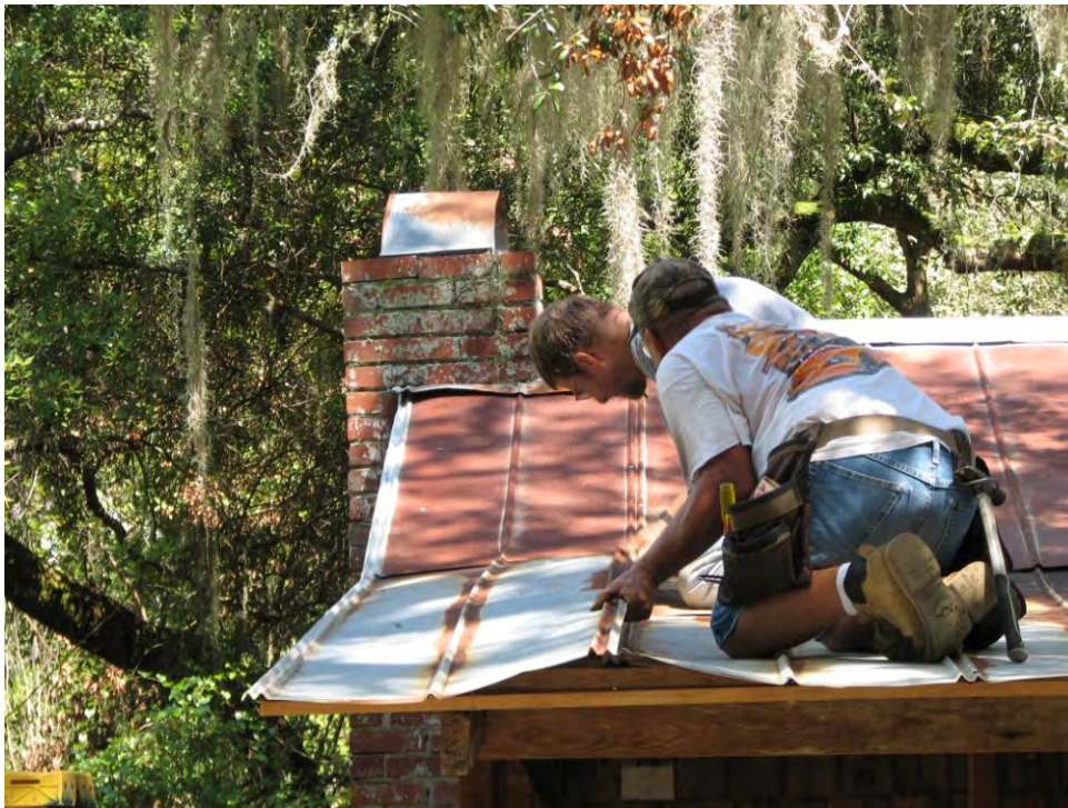
"Distressed" but sound tin fitted to porch roof. (2011-09-23, IMG 5463)