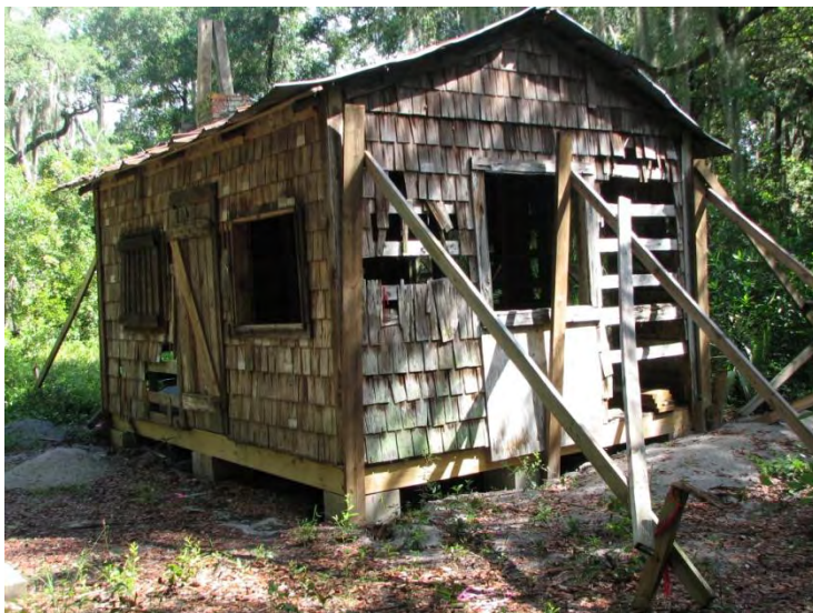
Cabin "de-levitated", with leveled chimney and restored floor set back down on a new and substantial subfloor and foundation...all to protocol. (2010-06-23, IMG 4597)