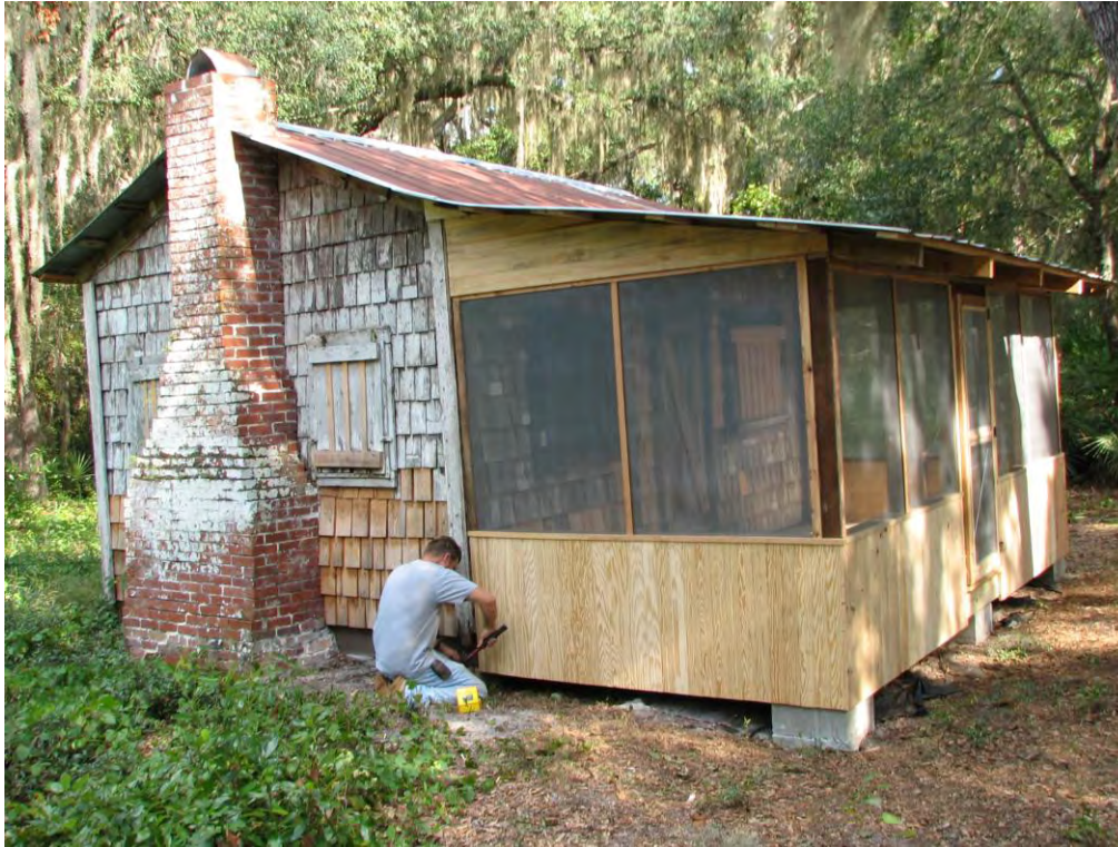
The last board. (2011-09-30, IMG 5529)