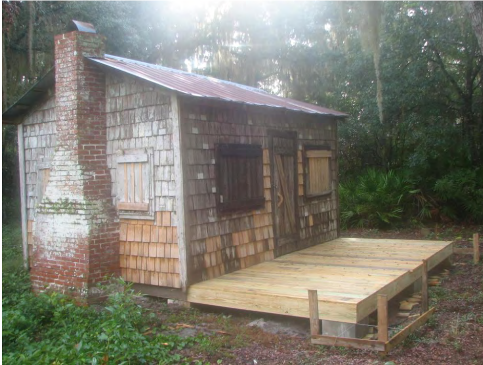
Deteriorated and removed porch is rebuilt according to documentation and protocol. (2011-09-23, IMG 5377)