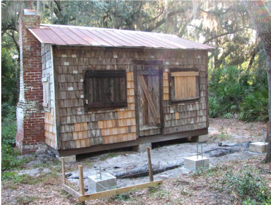
(2011_09_15), IMG5361) Concrete block porch piers laid and ready, 9-15-2011.