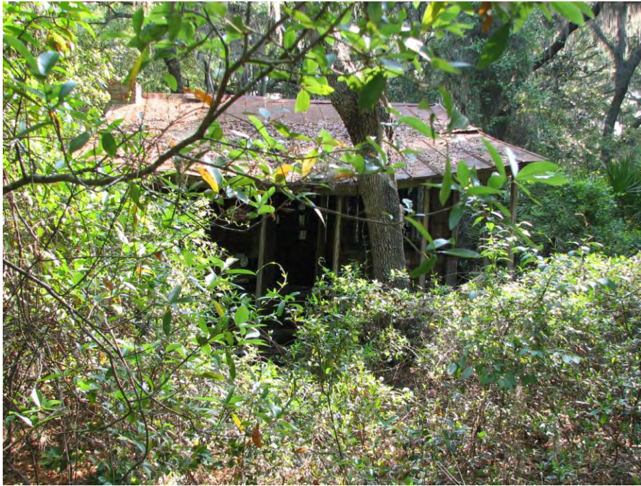
Cabin in brush in 2007 at time of donation, front view. (2007-05-02, IMG 0930)