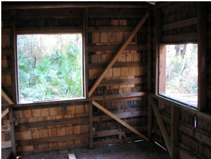
(2011_02_22, IMG 4830) Additional bracing detail.