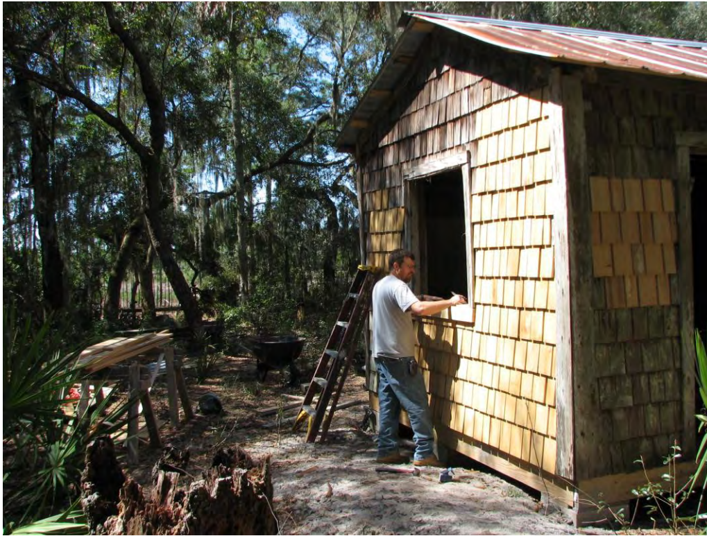
(2011_03_08, IMG 4917) Jeff restoring window frame on south wall.

Following the bracing of the interior of the cabin and replacement of decayed or missing milled cypress shingle siding, Jeff and his crew then carefully restored the window frames and wooden shutters and doors.