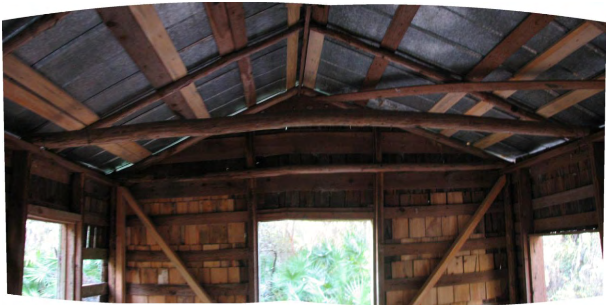
(2011_02_22: Carr Cabin Interior purlins)

Jeff was able to save all the original, peeled pine rafters and uprights in the cabin. However, to do so, and still provide structural stability, he added rough cut pine interior diagonal bracing, as per Shepard's stabilization protocol. Also, due to decay of some of the bases of the peeled pine pole uprights, he "sistered" vertical rough cut timber to the weakened pole, as per protocol and discussion with Herschel Shepard.