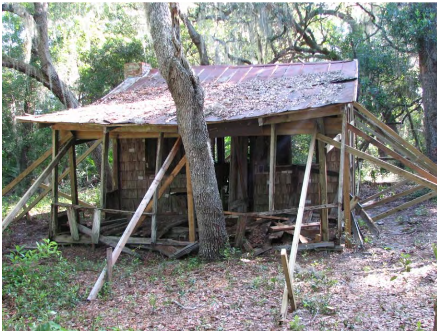
Initial bracing of cabin in 2007. (2007-07-11, IMG 1215)