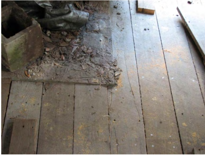
Re-installed, original floorboards, set to hearth elevation. (2010-03-18, IMG 4417)