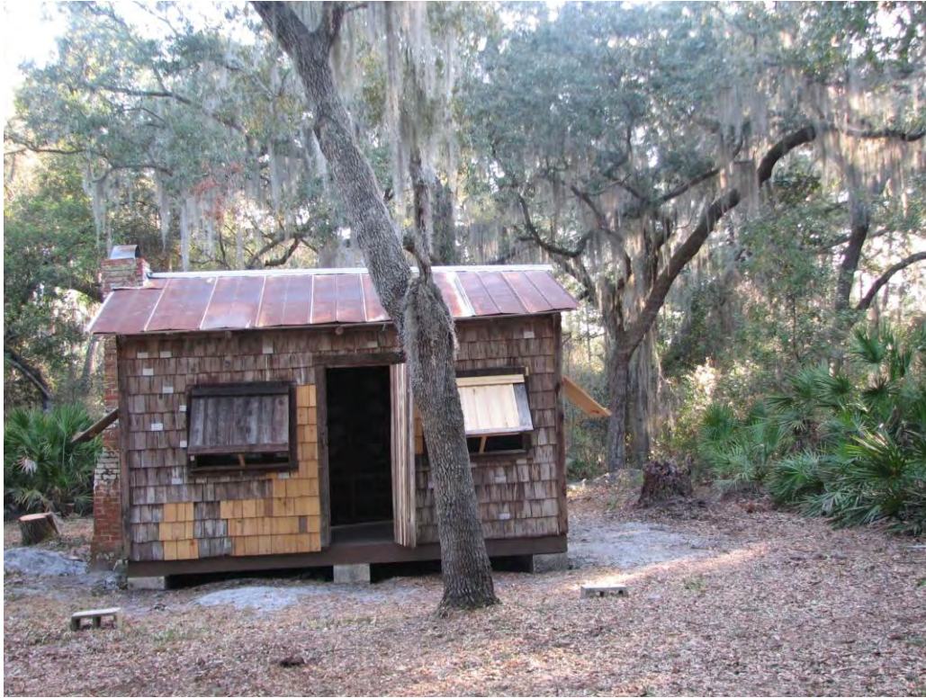
(2011_03_21, IMG 5086) West side (front/lakeside) of cabin.