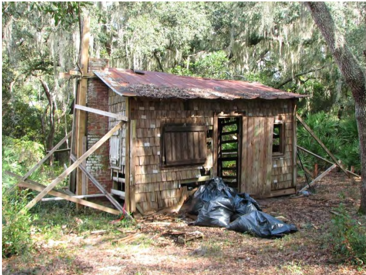
Portion of rodent debris bagged for removal. (2009-11-23, IMG 3981)