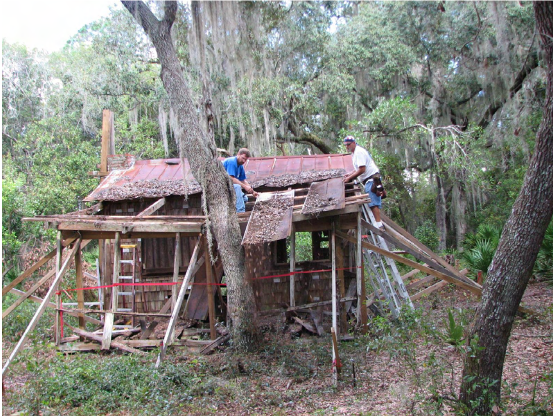
Careful dismantling of deteriorated portions of the cabin. (2009-10-29, IMG 3888)