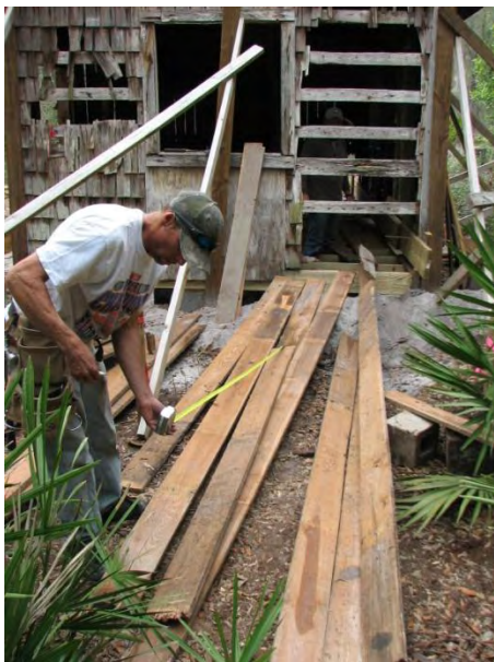
Inspecting and trimming rotten material from sound original floorboards. (2010-03-17, IMG 4396)