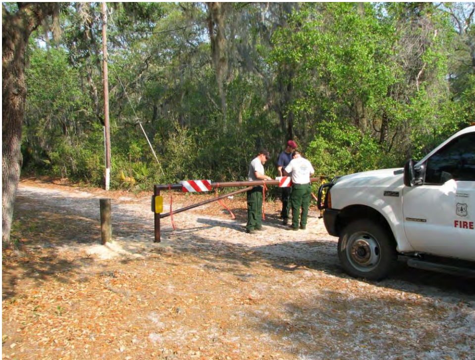
Gating access road for security. (2007-05-02, IMG 0928)