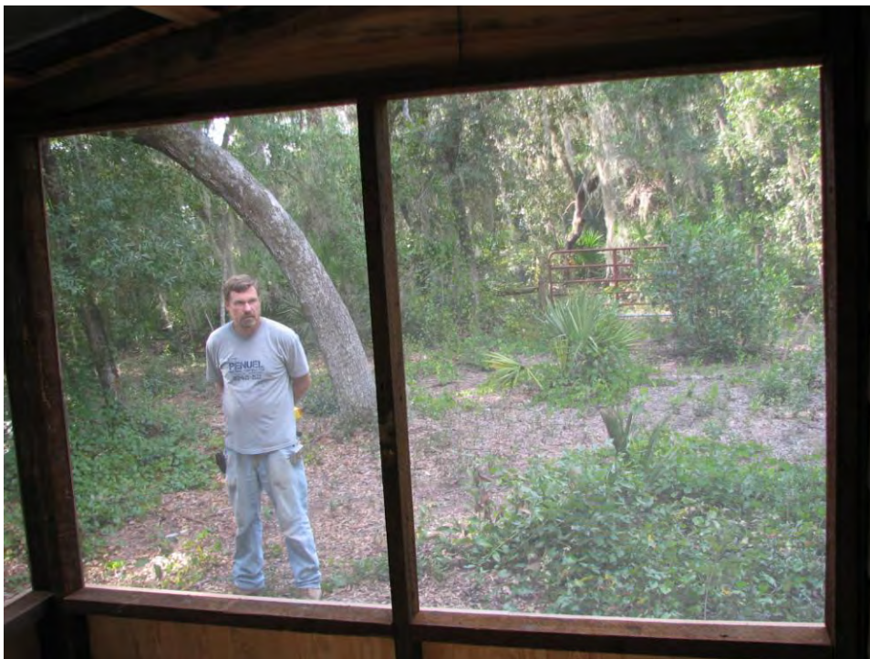
A craftsman's final critique. (2011-09-30, IMG 5535)