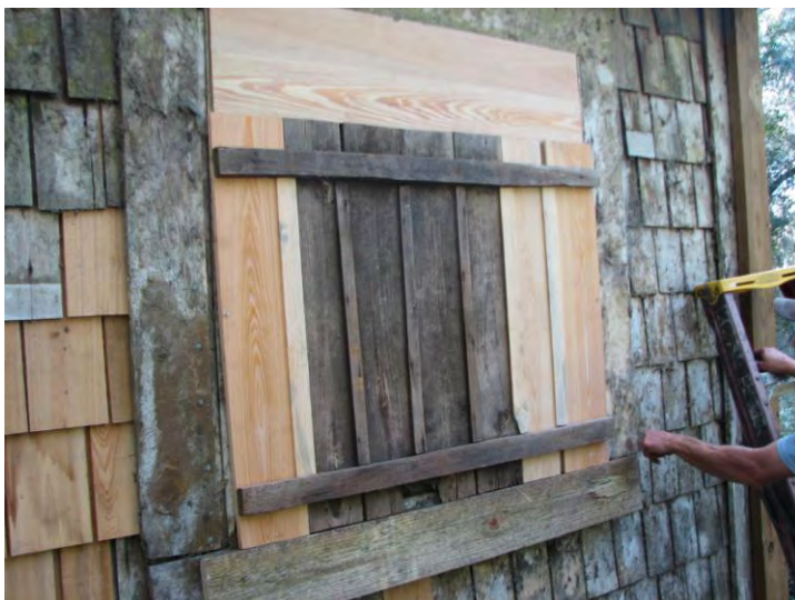
(2011_03_08, IMG 4921) Restored window shutter, east wall.