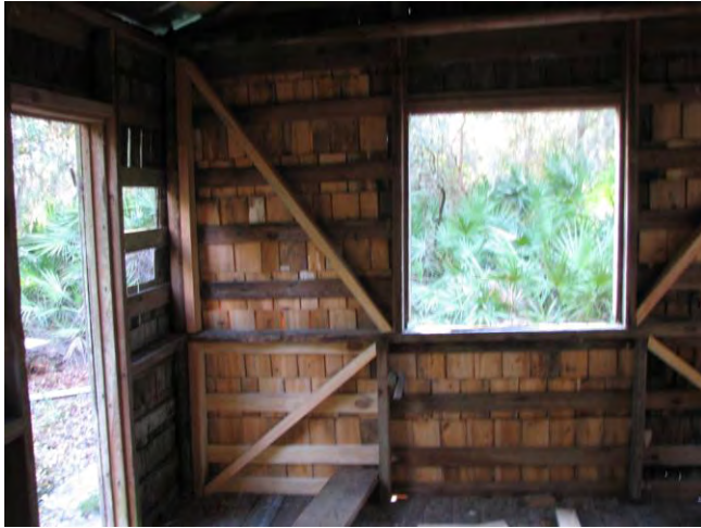
(2011_02_22, IMG 4829) Interior bracing