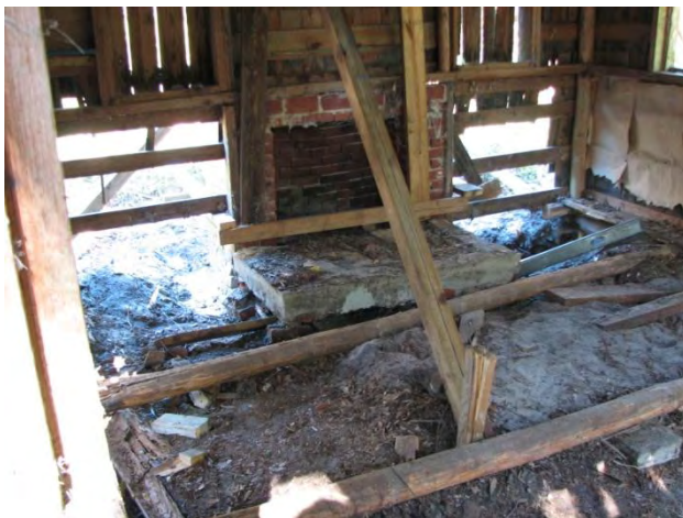
Hearth being leveled. (2010-01-19, IMG 4066)