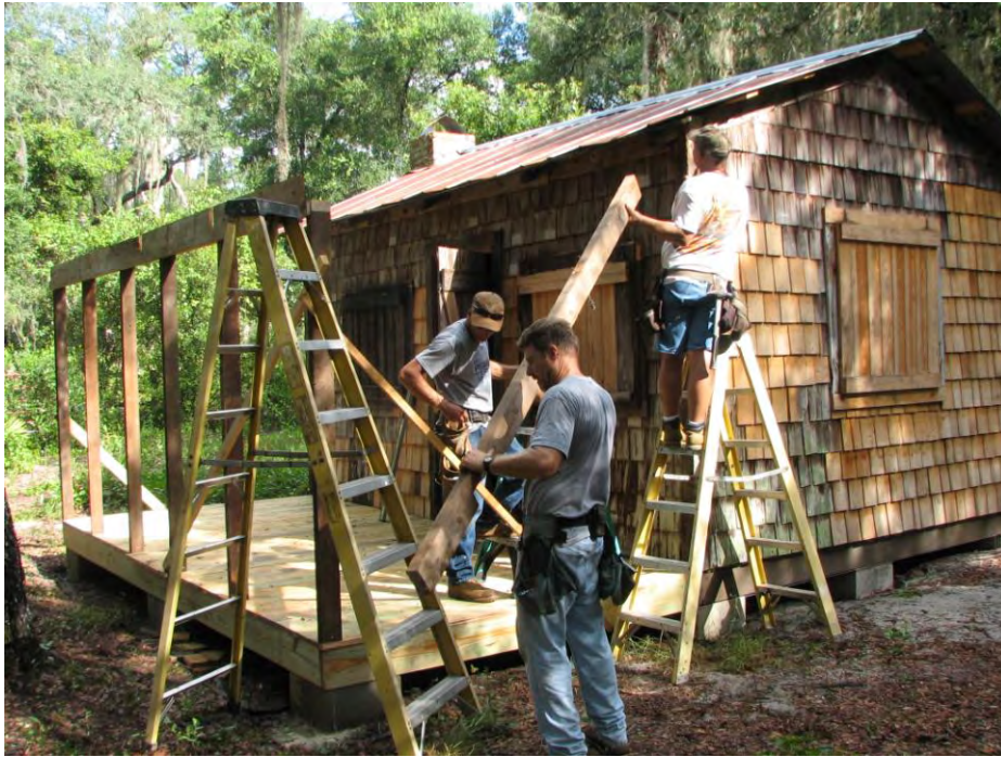
Porch framing going up utilizing the few surviving, sound timbers. (2011-09-23, IMG 5415)