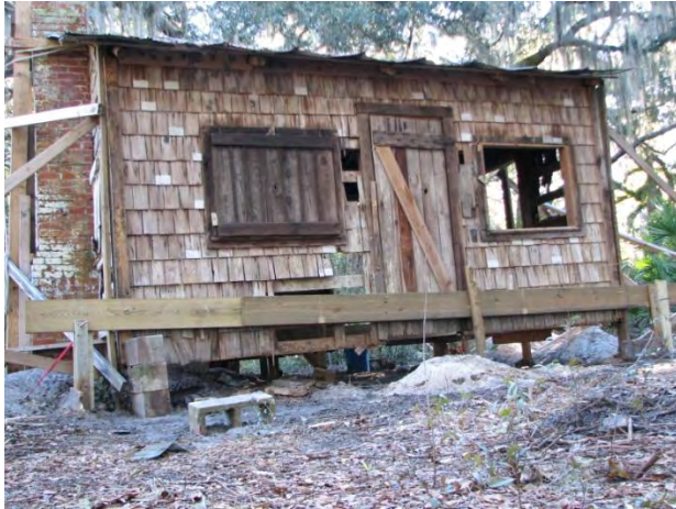
The “levitated” cabin, with foundation and subfloor removed! (2010-03-01, IMG 4252)