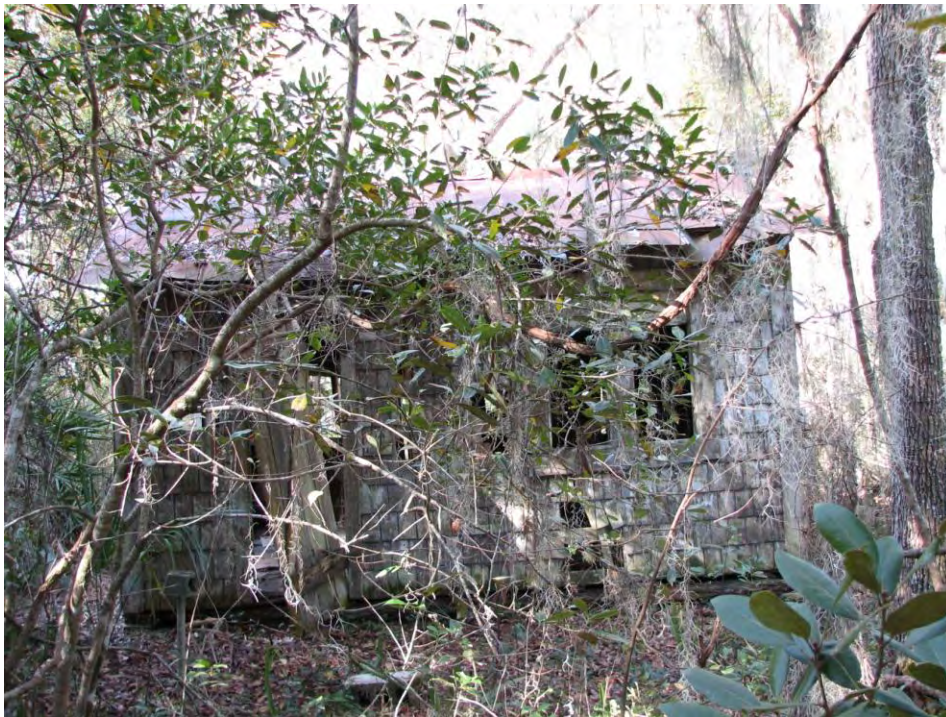
Cabin in brush in 2007 at time of donation, rear view. (2007-03-15, IMG 0348)