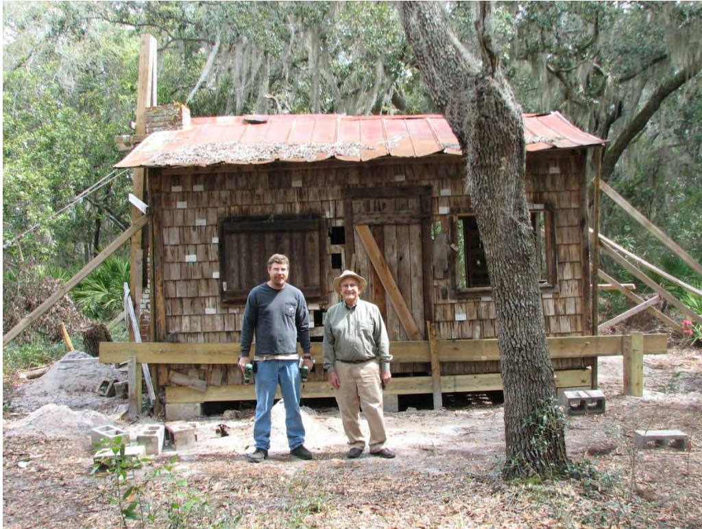
Craftsman - Architect - Cabin (2010-03-25, IMG 4480)