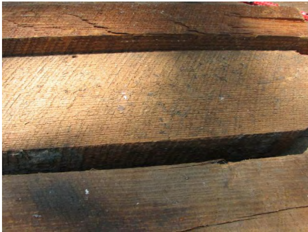
Close-up of lumber showing grain and old circular saw cuts-marks. (2010-07-09, IMG 4638)