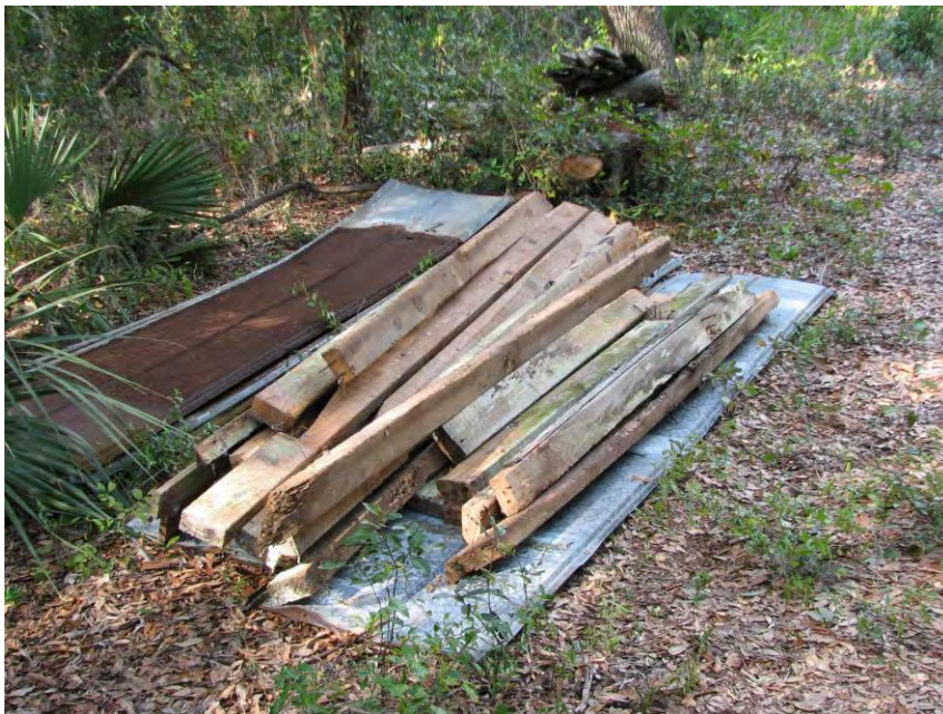
Salvageable material is set aside for later use. (2009-10-29, IMG 3915)